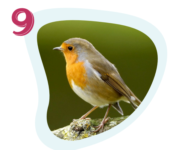
Name that bird: Robin