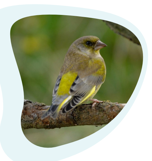
Name that bird: Greenfinch