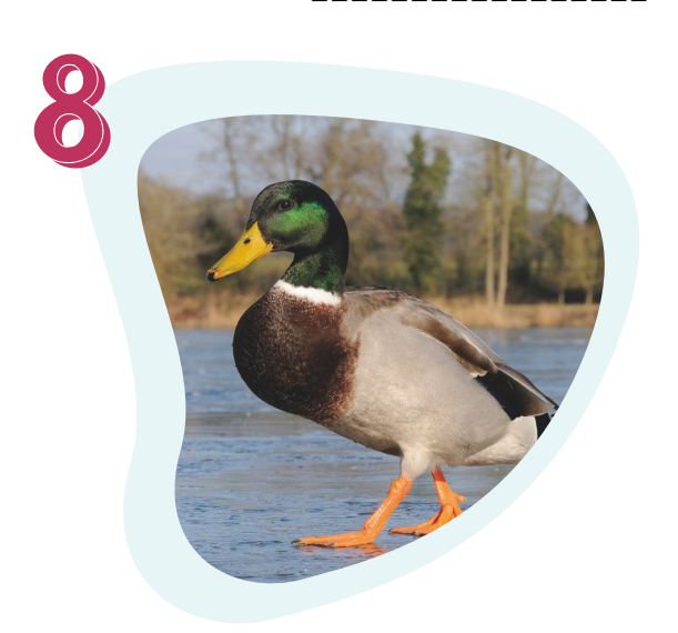
Name that bird: Mallard