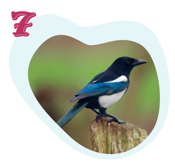
Name that bird: Magpie