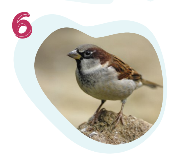
Name that bird: House Sparrow